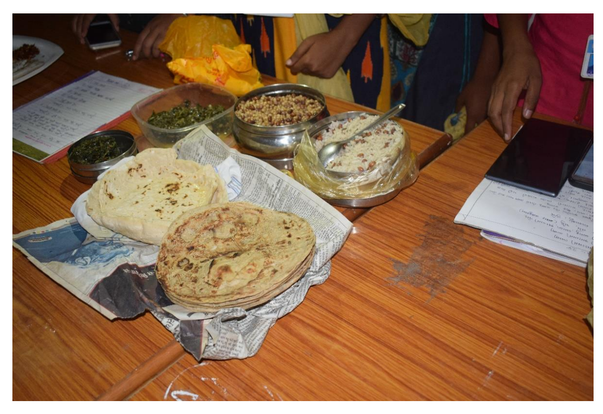
Bakla Rice, Bhaji, Juwar Rotla, Bajri Rotla