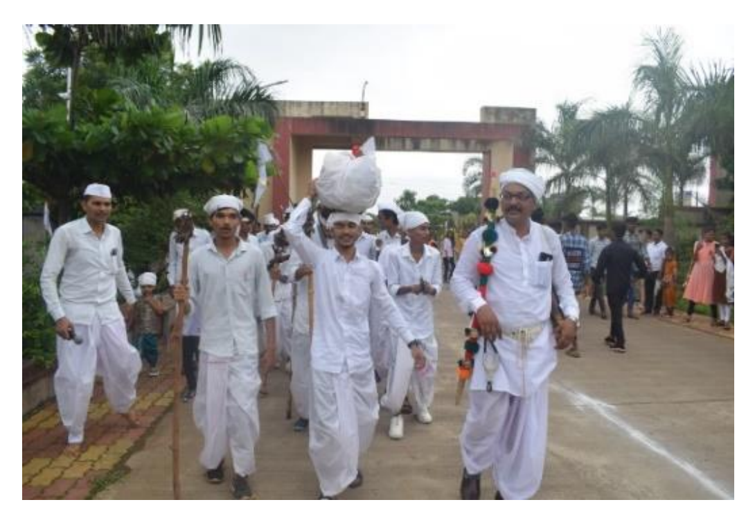
Holy march for Nandarva Dev