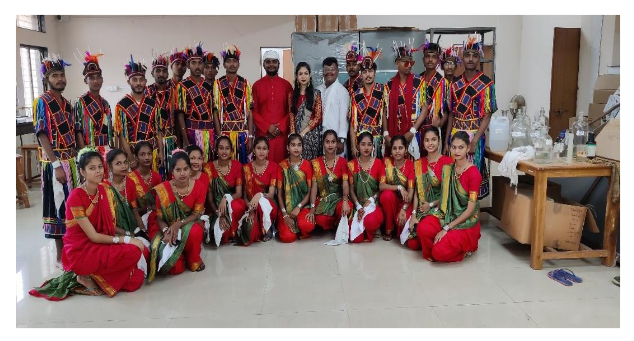
Traditional Kokani Dressing