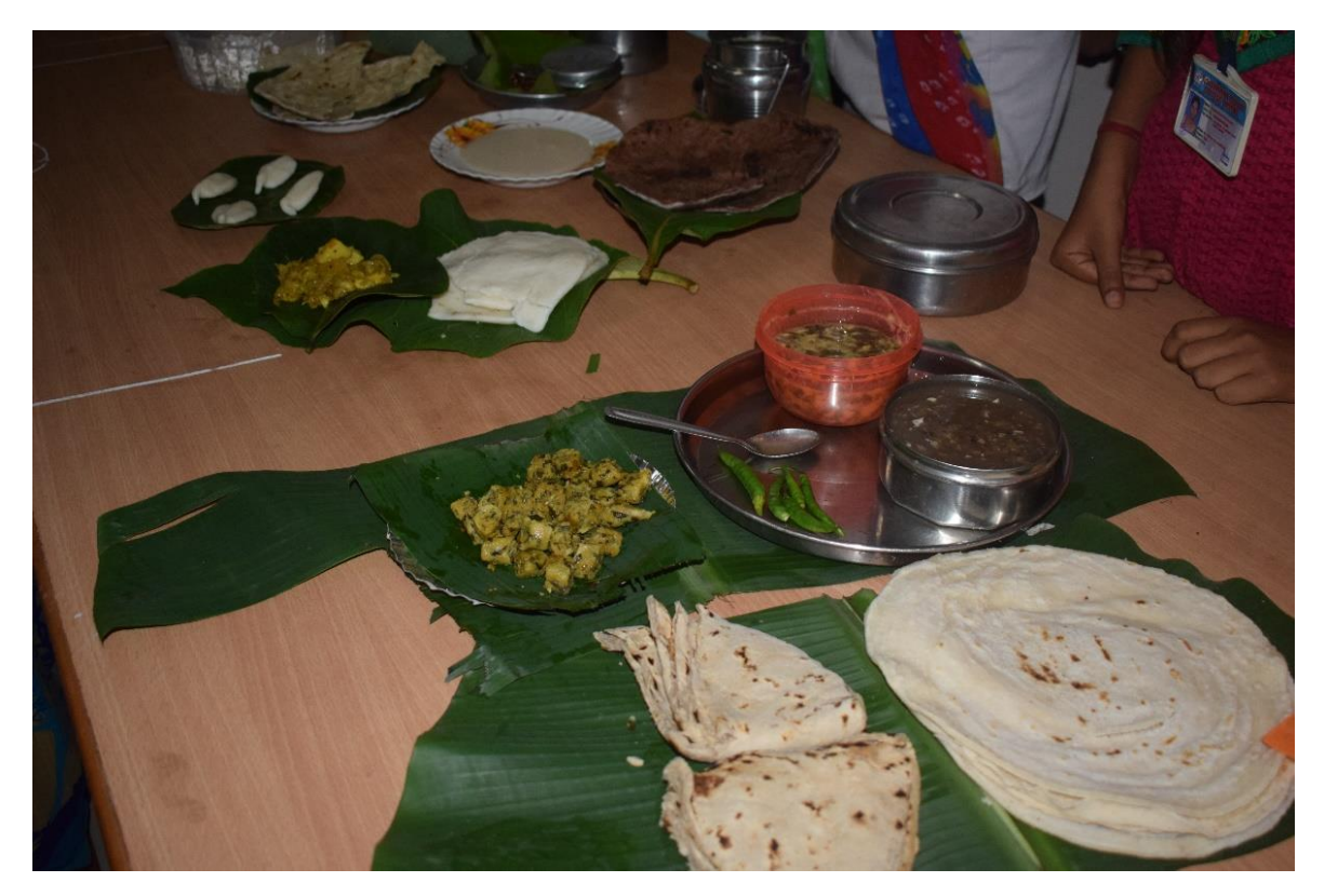
Bhaji muthiya, Udad's Daal, Nagli no Rotlo