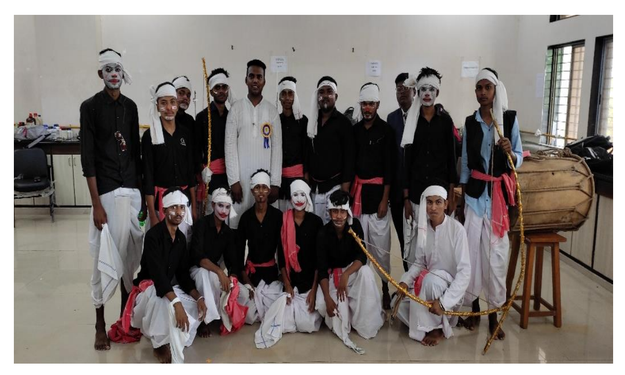
Traditional Vasava Dressing