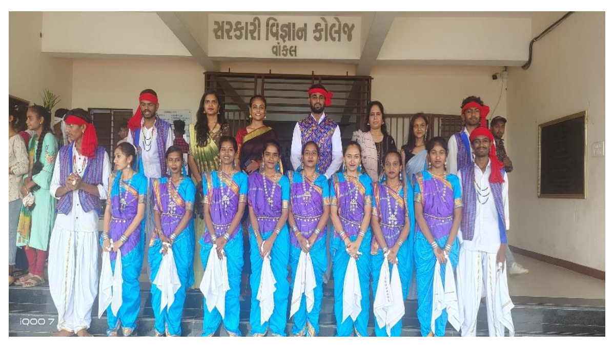
Traditional Rathva Dressing