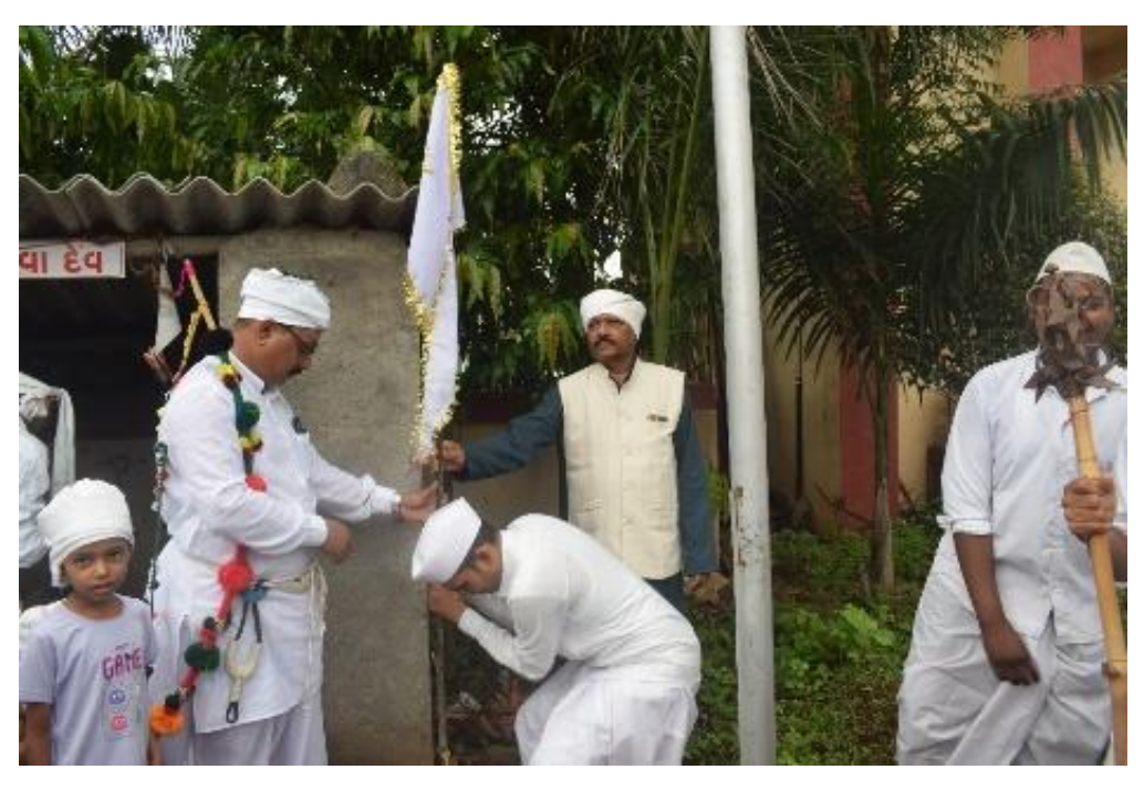
Spiritual Flag Hoisting of Nanderva Dev