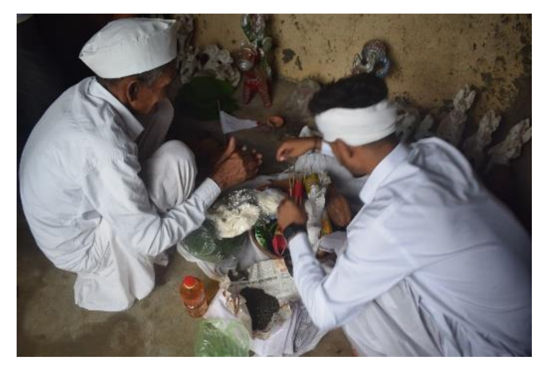
Performing Pooja of Nanderva Dev